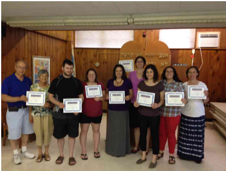
Last session of Chai Mitzvah -- we made havdalah and celebrated the end of our year of learning.