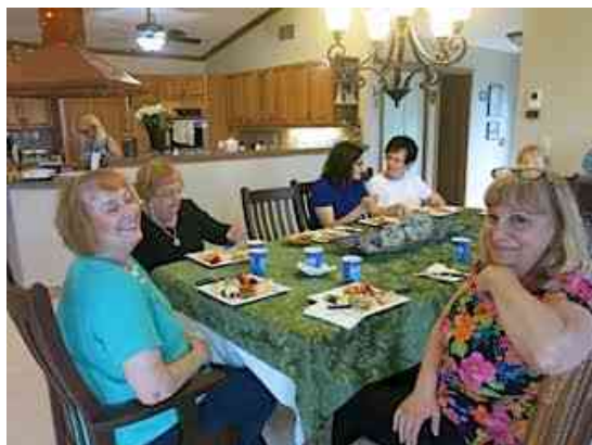
Potluck supper about to start