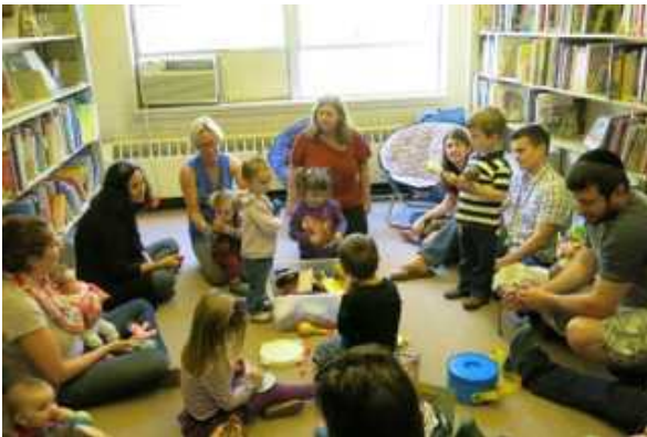
Yad b'Yad--a big group this year!