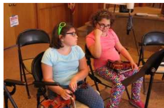
Sisters at orchestra rehearsal